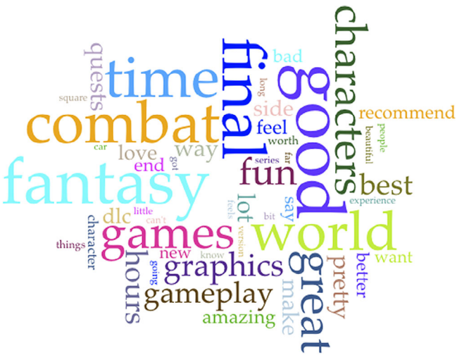
FIGURE 2 Word cloud generated by Voyant tools

However, engaging in qualitative analysis is not cost-effective for librarians to engage in. Topic modeling retrieved some limited information about themes, but