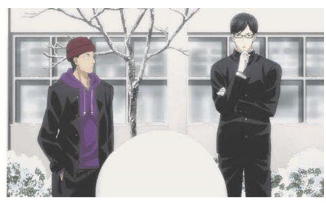
Figure 1. Screenshots of Mushi-shi (2005) and Haven't you heard? I'm Sakamoto (2016), from left to right.