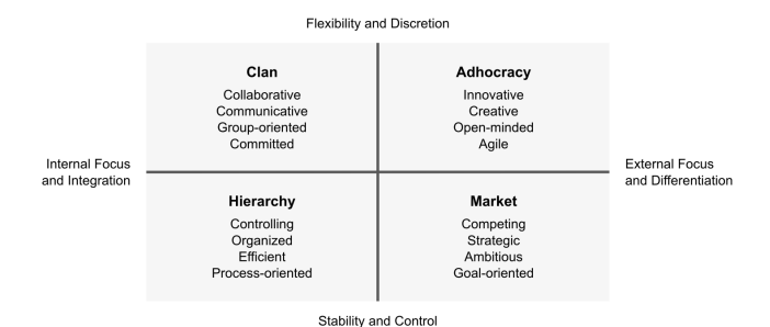
Figure 1: ARMY's culture type was assessed based on four characteristics selected for each of the four culture types—Clan, Adhocracy, Hierarchy, and Market—according to the Competing Values Framework and Organizational Culture Assessment Instrument [15].

3.1.1 How ARMYs see ARMY. We first wished to garner insights into perception of the ARMY fandom by its members. Participants delivered descriptions of how they view ARMY, and elaborated on confidence (or lack thereof) in the fandom. Prior pilot interviews revealed variances in how individual ARMYs regarded the fandom—for instance, as an organization or a large team. As we could find no established metrics specifically for fandoms, we considered various metrics with which to characterize ARMY. For organizational